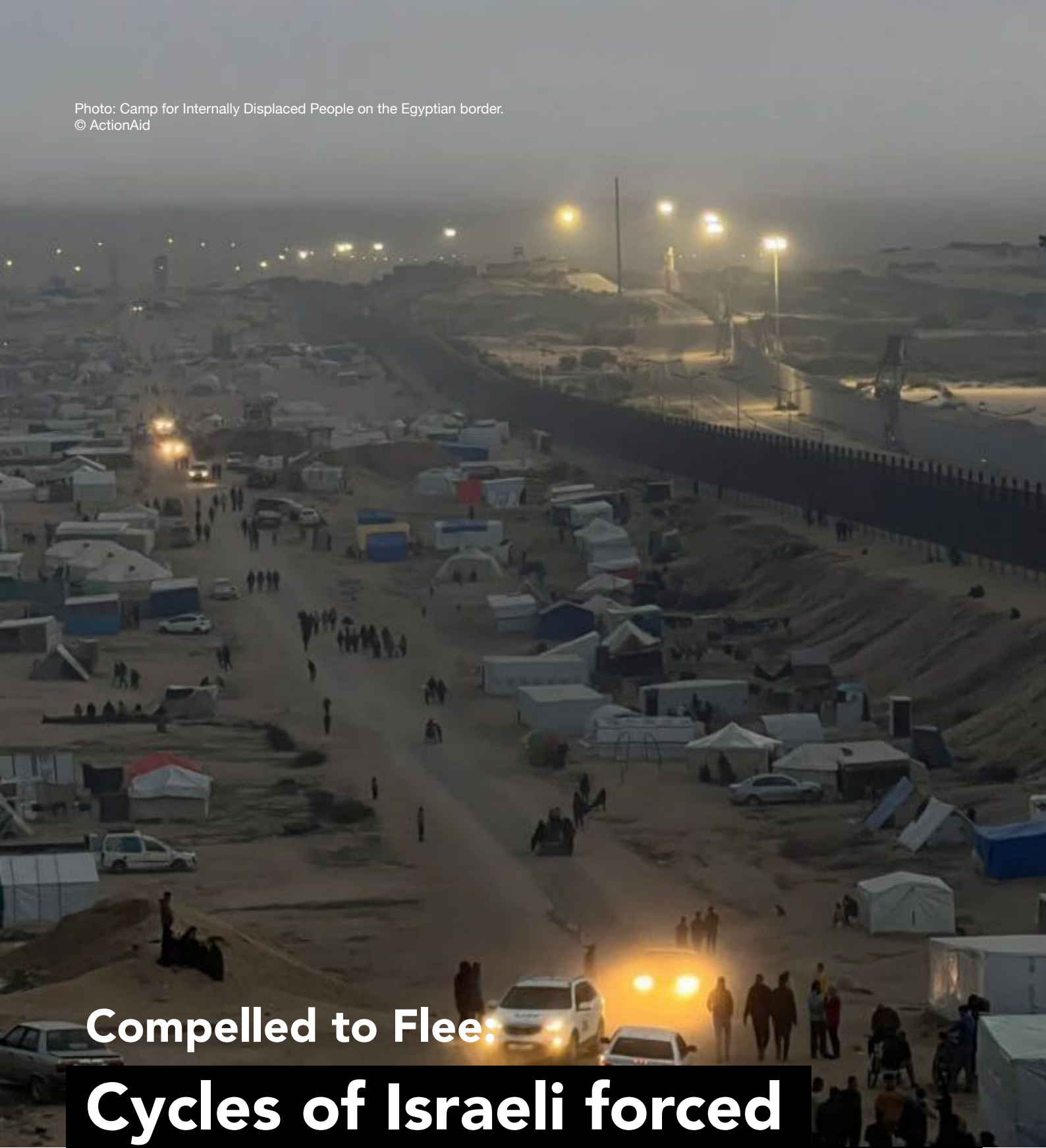
Photo: Camp for Internally Displaced People on the Egyptian border. © ActionAid